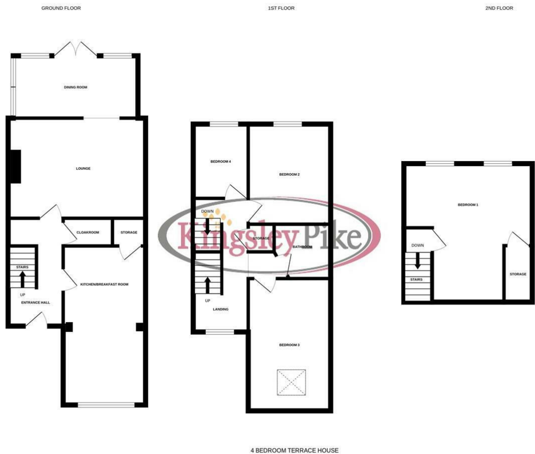
4 BEDROOM TERRACE HOUSE

Whilst every attempt has been made to ensure the accuracy of the floorplan contained here, measurements of doors, windows, rooms and any other items are approximate and no responsibility is taken for any error, omission or mis-statement. This plan is for illustrative purposes only and should be used as such by any prospective purchaser. The services, systems and appliances shown have not been tested and no guarantee as to their operability or efficiency can be given. Made with Metropix ©2026