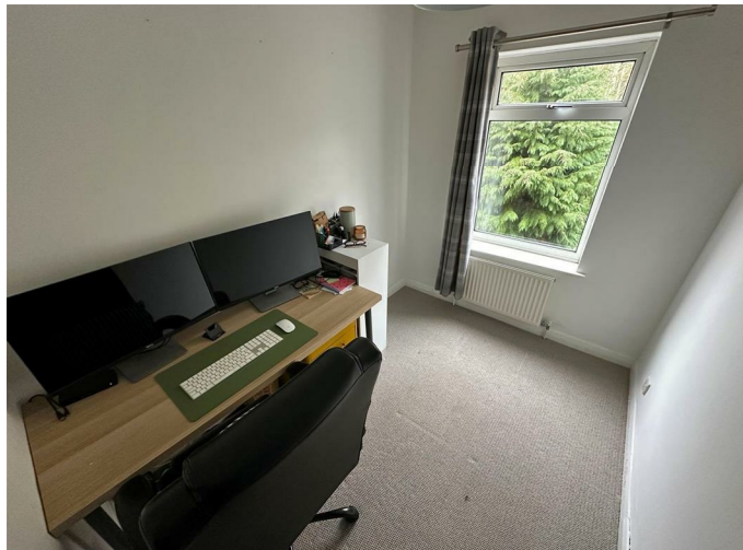
Bedroom Four 6'06 x 8'06 (1.98m x 2.59m)